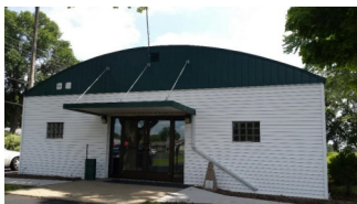
VFW Recreation Center 1420 South Rockwell Ave.